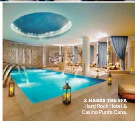
X MARKS THE SPA Hard Rock Hotel & Casino Punta Cana.

Or, get pampered at the renowned Rock Spa, home to an aqua center with hydrotherapy circuits, clay and color therapy steam rooms, saunas, a sensory experience pool, and an ice room. Golfers are challenged at the 18-hole Nicklaus-designed golf course, and gourmands go all out at 11 restaurants offering everything from Brazilian to Asian. Guests also enjoy 11 pools, four swim-up bars, a kid's pool, and a lazy river. hardrockhotelpuntacana.com .