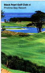
Black Pearl Golf Club at Pristine Bay Resort

20 CANADIAN RETREAT: Fairmont Banff Springs' Stanley Thompson 18 could be as cool a course as you'll find.